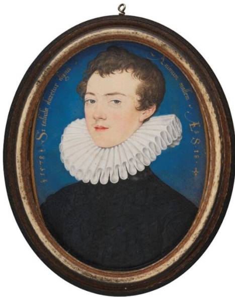
Sir Francis Bacon (circa. 1578)

forth in the middle of the text -- defensive , meant to shield its practitioners from persecution; protective , serving to insulate its audience from "dangerous truths"; pedagogical , in which obscurity and ambiguity are seen as teaching tools in and of themselves; and finally, political esotericism. The last is the joker in the pack, distinct from the other three in two ways: first, for being a thoroughly modern phenomenon, no more than three or four centuries old; and second, for being inspired by purely political rather than philosophical motives -- intended neither to promote and protect philosophy nor to shield society from its truths, but instead to use it as an instrument for changing the world. Thus cloister -- the "single word that best conveyed the essential characteristic of premodern philosophical secrecy" -- gave way to " conspiracy , which is initial concealment for the sake of future disclosure." [46]